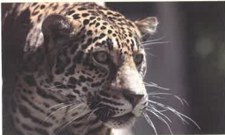
Visit Sophia the jaguar at Happy Hollow Park & Zoo.

On Tuesday, June 12, July 10 and August 14, from 10 am to 5 pm, admission to Happy Hollow Park & Zoo is only $1 per person. Your escape to another world can continue through the Japanese Friendship Garden and into History Park, all in one day.