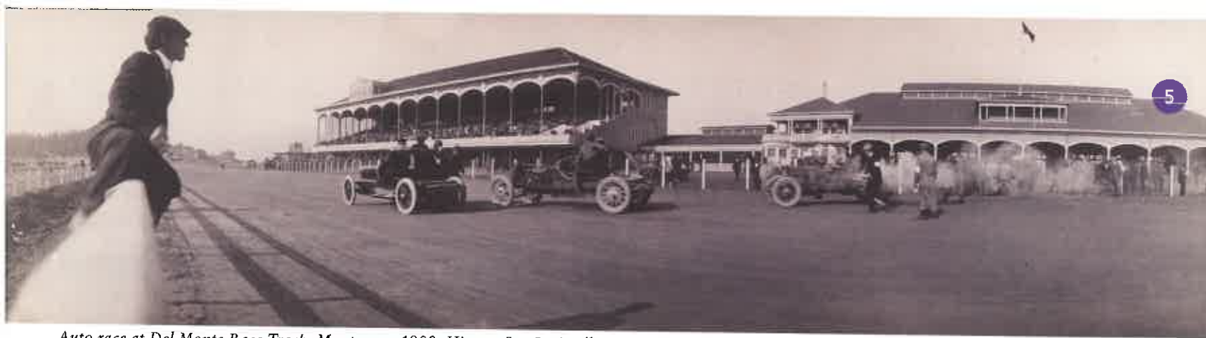
Auto race at Del Monte Race Track, Monterey c.1908. History San José collection. Gift of Trinity Episcopal Cathedral.