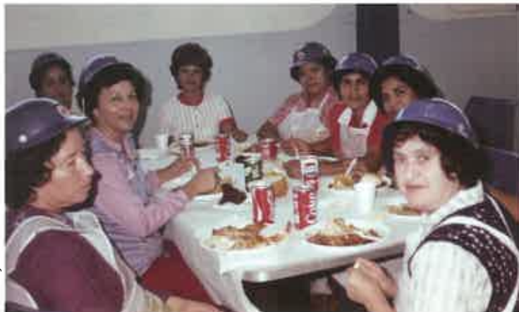
End of season party, Del Monte cafeteria, 1973.

Yet in other ways, the cannery provided a unique opportunity for women to work while raising families. Mothers of young children often worked night shifts, switching to daytime work as their children got older, and eventually moving to year-round positions as those became available. These women tell stories of how they came back every year for harvest season and worked alongside the women who became their closest friends, and who even introduced them to the men they would one day marry, creating a close-knit community. The cannery is gone, but their stories remain.