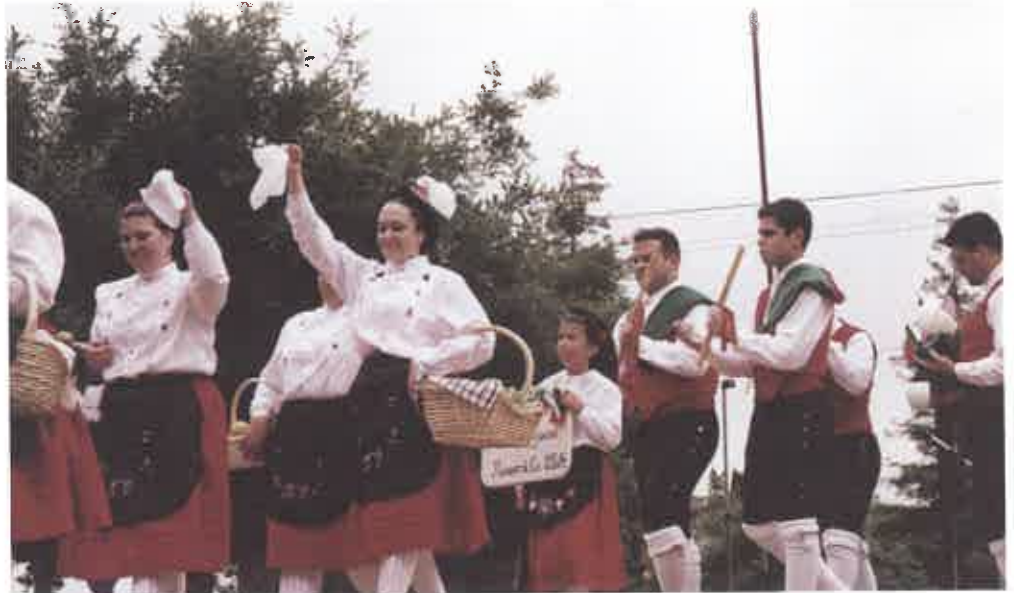
Parade through History Park at the Dia de Portugal Festival.

Each year, the Portuguese Heritage Society of California proudly hosts the Dia de Portugal Festival at History Park, the home of the Portuguese Historical Museum. This fabulous event draws over 6,000 people for Portuguese food, dance, music, costumes, and history. Starting at noon, children can take part in “Grandma’s Quilt,” a fun search through History Park for clues to a quilt which tells the story of a Portuguese family’s history in the Santa Clara Valley. A Children’s Carnival from 10 am to 5 pm offers games, prizes, arts and crafts, storytelling, a jump house and more. Volunteer interpreters will provide free tours of 10 historic buildings. Enjoy the artist’s tent, Book Faire, a parade of Portuguese organizations, cooking demonstrations, and raffle. Admission is free; city parking is $6. For information, visit www.diadeportugal.com .