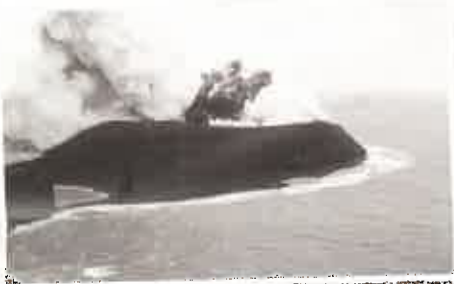
Postcard of Capelinhos erupting in Portugal's Azores, c. 1957.