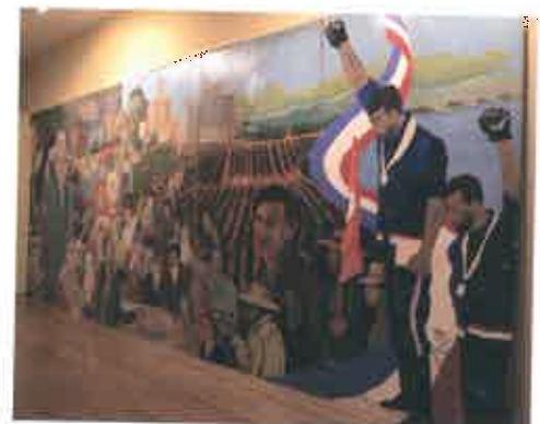
A complete view of the mural Freedom vs. Exploitation = Revolution.

The mural was soon moved from its first location to a space deep in the basement of the student union. It was later attacked by a vandal who scrawled words between the figures of Smith and Carlos. Eventually the mural was discarded. It remains a powerful documentation of social history that continues to raise awareness and spark emotion thirty years later, and a tribute to those social and political issues its creators found most urgent.