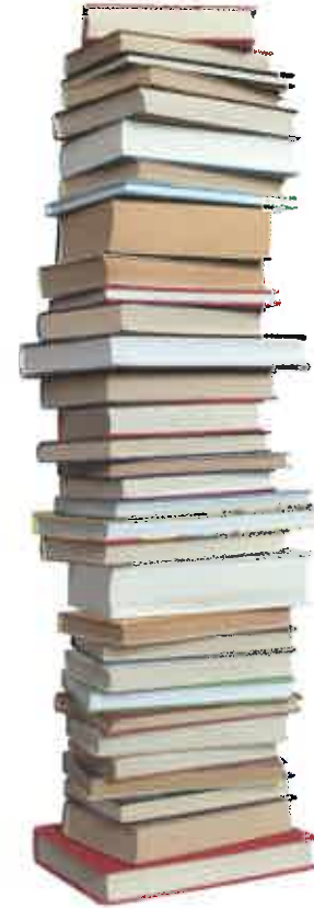
Bean Spray Pump Co. Catalog No. 20