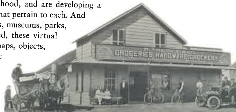
R. Trevy & Co. Store, Alviso, California.

Each neighborhood will have its own dedicated pages, in-depth information and unique design. We will provide historical context for each neighborhood, and are developing a searchable catalog of all the artifacts in HSJ’s rich collection that pertain to each. And we’ll provide resources such as links to local schools, libraries, museums, parks, and organizations for residents and visitors. When completed, these virtual neighborhoods will include access to images and records of maps, objects, photographs, and documents in the HSJ collection that relate to each neighborhood. Come and take a stroll through your neighborhood! It’s only a click away.