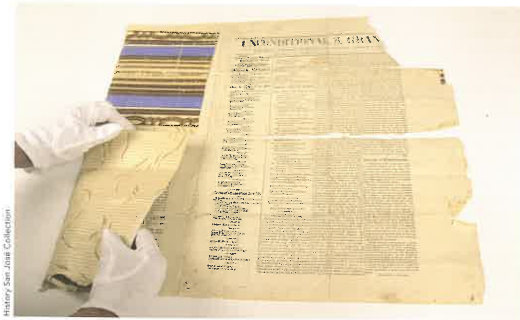
The Unconditional S. Grant, 1863.

History San José recently received a National Endowment for the Humanities grant of $89,467 to stabilize and move the Research Library to the Collection Center. We have already raised $44,000 toward matching that grant. A total of $9,000 was raised at the Annual Valley of Heart's Delight fundraising dinner alone, during a special segment of the live auction