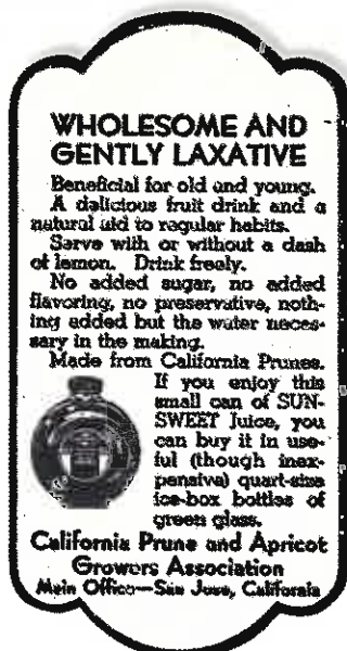
Portion of a Sun-Sweet Prune Juice label.